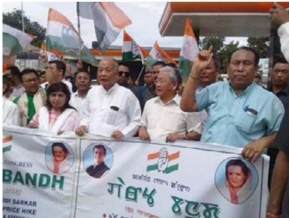
hill district leh valley ah educational institutions leh business establishments te kikhak hi ah muthei ah a umna chung ah muthei a hina

Imphal, Sept. 10: India gamsung ah Petrol, Diesel leh van man chuam chuam nasatak ah a kal ziak in All India Congress Committee (AICC) in India gamsung pumpi huap in, tuni, Sept 10, 2018 in Bharat Bandh kiti a chiapi a, India gamsung mun tamzaw ah sumkawlveina, institution te a kikhak hi. Manipur ah le zingkal lam dak 6:00 a pat nitaklam dak 3:00 tiang in Bandh a um hi. Manipur ah Bharat Bandh chief coordinator MP Bhubaneswar Kalita in Manipur state sung